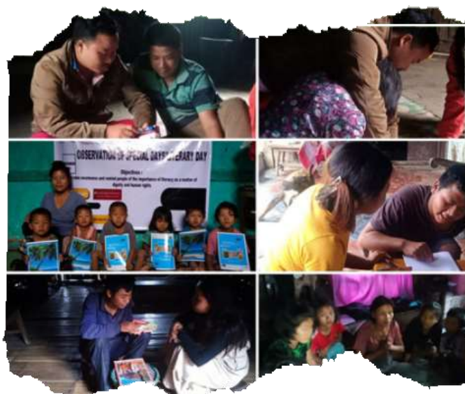
INTERNATIONAL LITERACY DAY