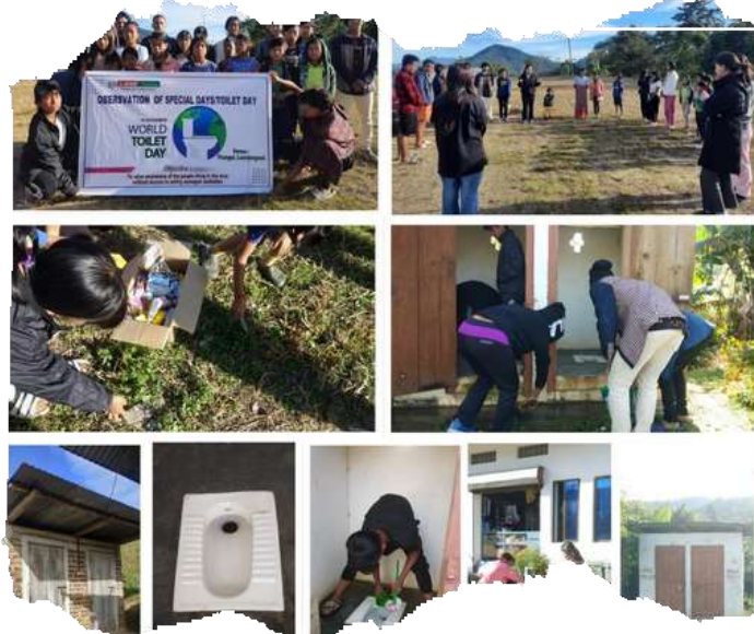
WORLD TOILET DAY