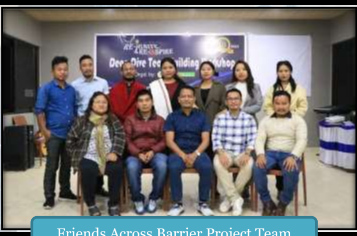
Friends Across Barrier Project Team