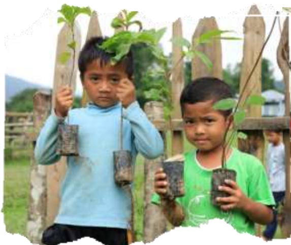
WORLD ENVIRONMENT DAY

Important days are observed with the children and youth from the different project villages because we believe that a good and conscious citizen is someone who is well verse and aware of themselves and their surroundings. An informed citizen will surely be an asset for the country and this awareness will make them take action towards making the world a better place. Some of the important days observed are such as: World Environment Day, International Women's Day, International Literacy Day, Republic Day, etc.