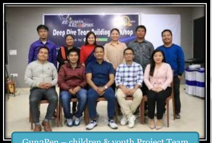
Gun2Pen – children & youth Project Team