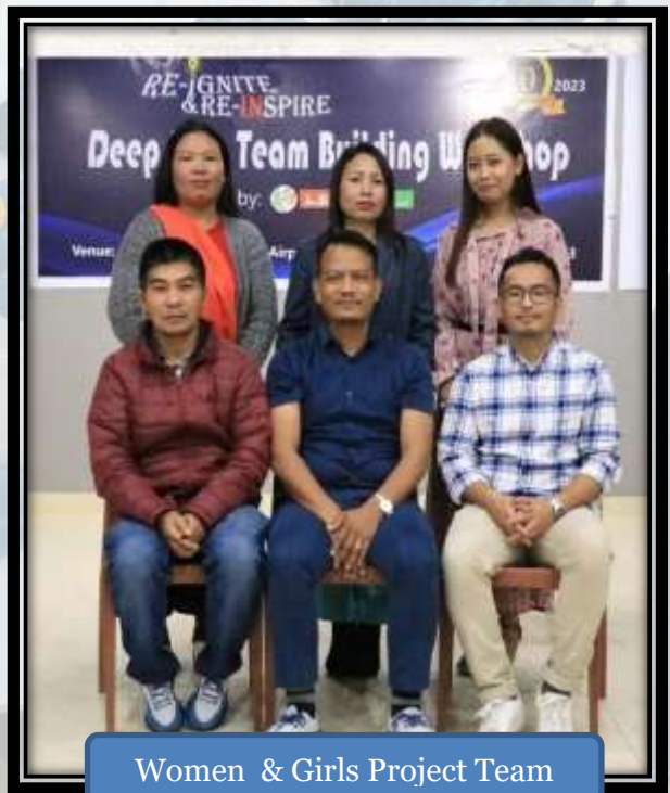
Women & Girls Project Team